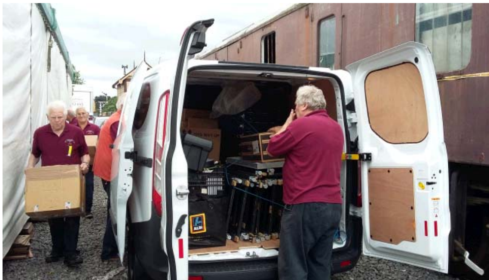
The van is loaded for the trip home after the Great Central event.